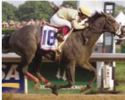
Monarchos winning the Kentucky Derby.

From the New York Times article, Nurturing a Colt's Inner Superstar - June 3, 2001