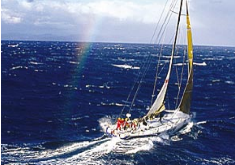
Team Tyco will use the Infratonic around the world.

Team Tyco will be using two Infratonics in preparation for the Volvo Ocean Race and during stop-overs in major ports around the world. The Race will start from Southampton, England on September 23 rd , 2001.