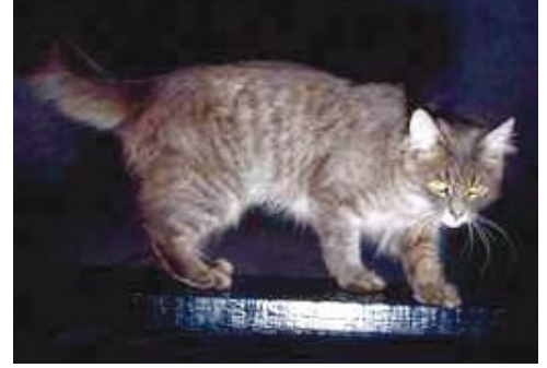
Injured cats also purr to heal themselves.